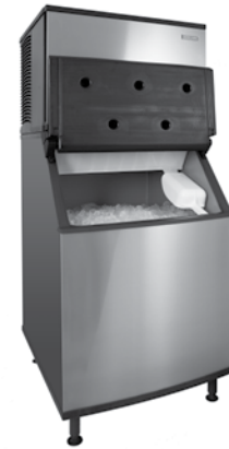
Pictured: Koolaire Kubler K600 series on a K570 bin